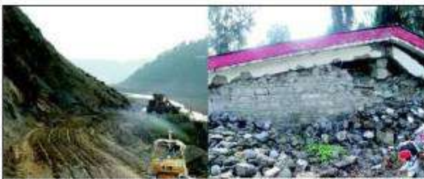
Landslides and building collapse are the common damages during disasters

Landslides in Abbottabad are usually generated by earthquake, flash floods and heavy snow burden. Landslides usually happen during the Monsoon season from July to September when heavy rainfall softens rock and earth surfaces especially in mountain areas. Several roads become temporarily blocked and